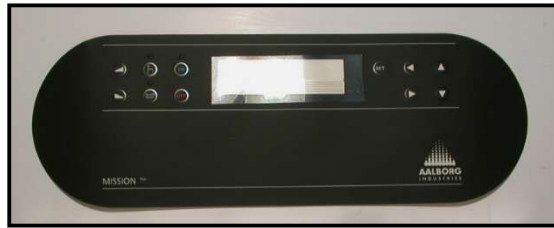
Local Panel: Mission Controller in the grey box and front foil from Alfa Laval.