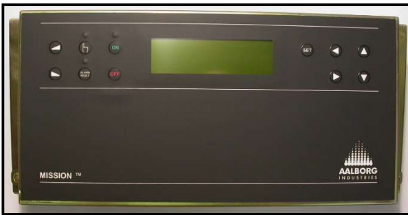
Power Panel: Mission Controller with Alfa Laval Foil.